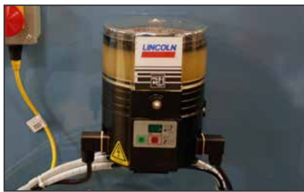
Auto Lubrication System

•• Remote Pedestal Operators Console with speed