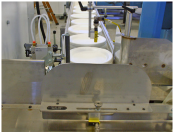
Product-Stack Align Gate