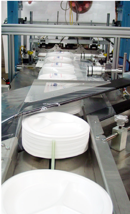
Seal Bar Feed Vacuum Conveyor

The Irwin Research "STACK PACKER" is a free standing, continuous motion system designed to bag thermo-formed products in conjunction with a vertical trim press of other means.